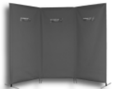
SERVICE-RIGHT™ Portable Barrier Systems