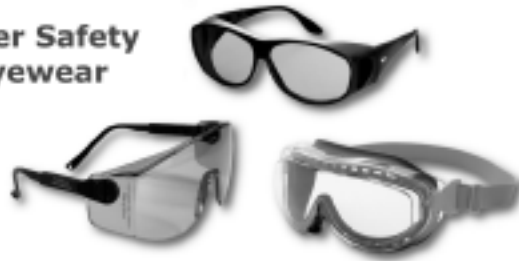
Laser Safety Eyewear