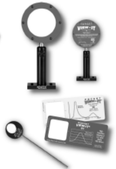
VIEW-IT™ IR & UV Detectors