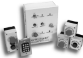
ENTRY-GUARD™ Safety Interlock Systems