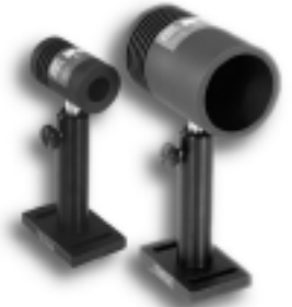
TRAP-IT™ Beam Dumps