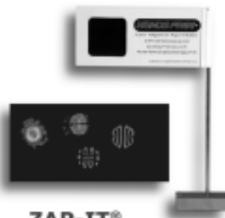
ZAP-IT® Alignment Paper