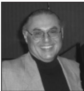
Dr. Henry Helvajian

HH: They can clearly be assistants, in small groups and with VPN-like (Virtual Private Network) connectivity they can conduct their own experiments or missions and send only the results to the “mother” ship, but because they are primarily made of moldable material they can be shaped. If a satellite primary payload is supposed to be an antennae dish, the satellite does not need to be a big blocky thing with a dish. These advances could change the shape and size of tomorrow’s satellites so they look more like the primary payload rather than a bus with baggage on top. ✱